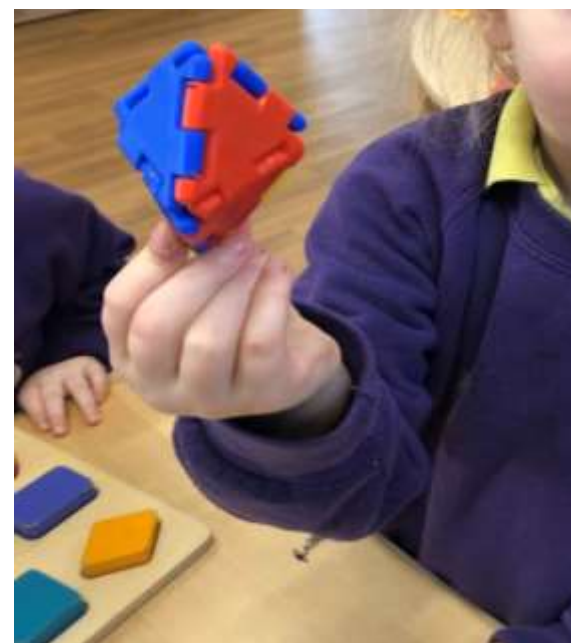
Edenside Primary School & Nursery @EdensidePS - Jan 20 Thank you to the many parents & carers who came to our #EmergingLiteracy session today. It was a wonderful opportunity to share with families the fun, practical ways that our youngest learners are developing pre-handwriting and pre-reading skills. #familylearning @58CLiteracy