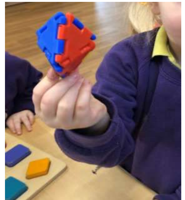
Edenside Primary School & Nursery @EdensidePS - Jan 20 Thank you to the many parents & carers who came to our #EmergingLiteracy session today. It was a wonderful opportunity to share with families the fun, practical ways that our youngest learners are developing pre-handwriting and pre-reading skills. #familylearning @58CLiteracy