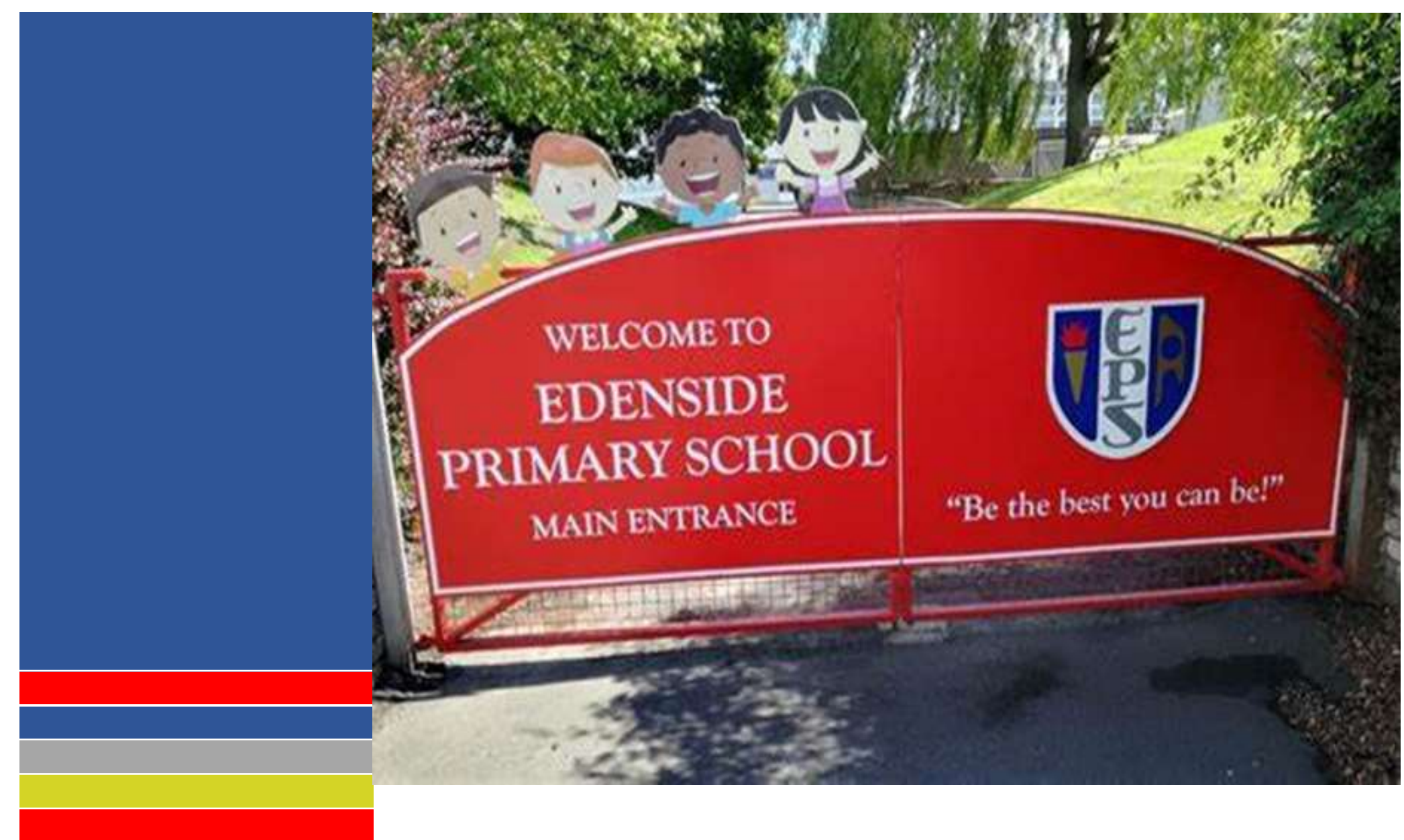
Full of Learning, Laughter and Love