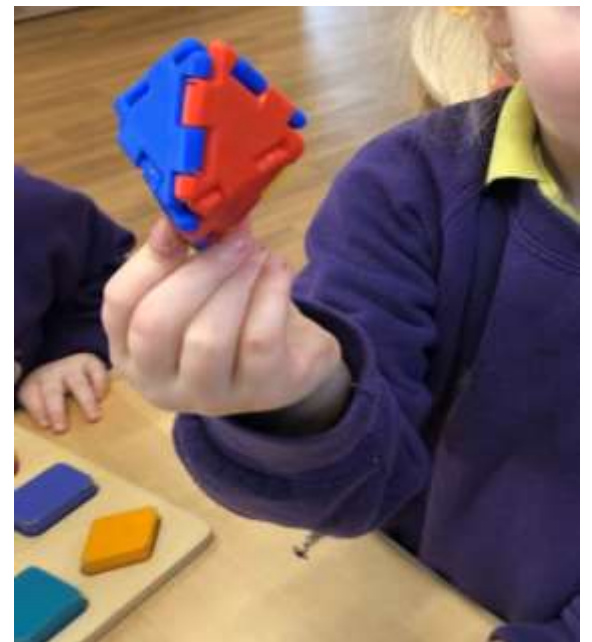
Edenside Primary School & Nursery @EdensidePS - Jan 20 Thank you to the many parents & carers who came to our #EmergingLiteracy session today. It was a wonderful opportunity to share with families the fun, practical ways that our youngest learners are developing pre-handwriting and pre-reading skills. #familylearning @58CLiteracy