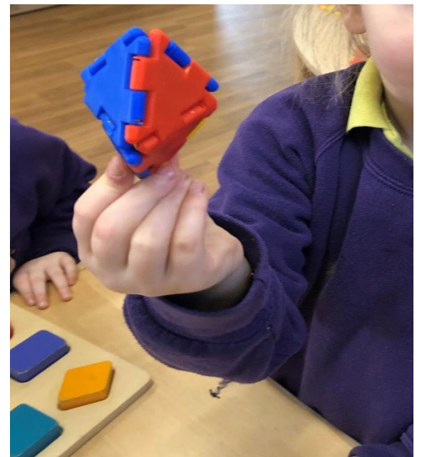
Edenside Primary School & Nursery @EdensidePS · Jan 20 Thank you to the many parents & carers who came to our #EmergingLiteracy session today. It was a wonderful opportunity to share with families the fun, practical ways that our youngest learners are developing pre-handwriting and pre-reading skills. #familylearning @SBCLiteracy